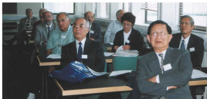
Fig. 4. The 9misfv International Organising Committee and the Honorary Board.